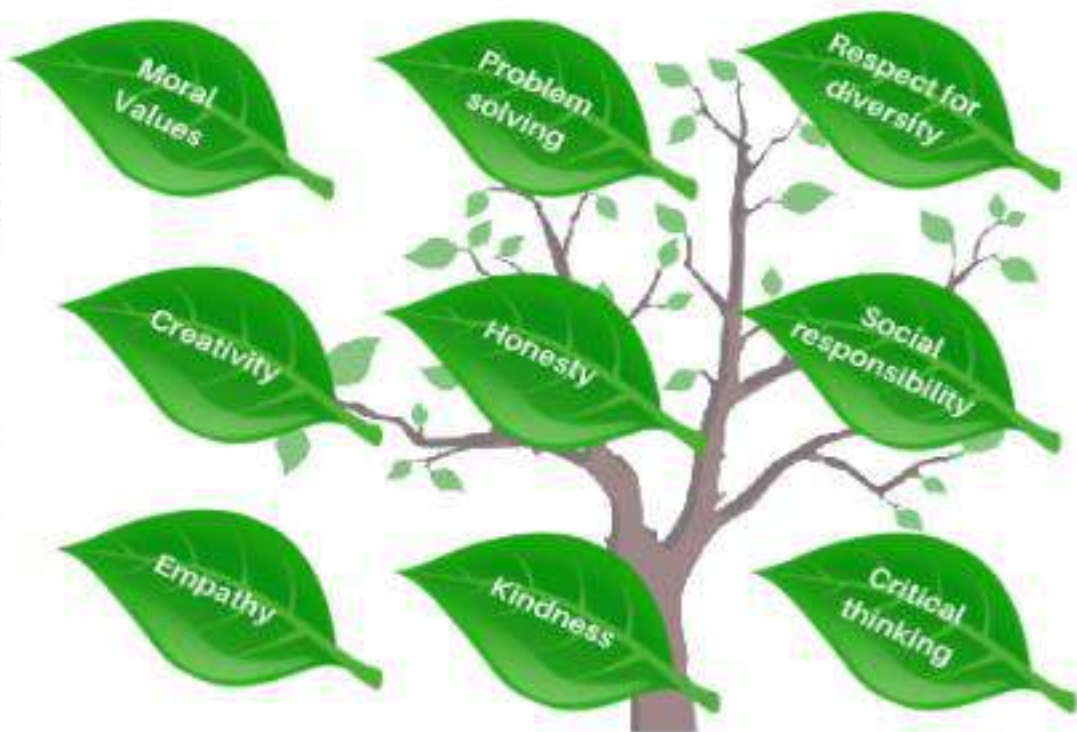
Our tree of values