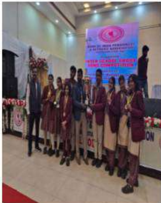
DAV Bariatu won the First prize in the Inter -School Music Competition. The competition was organised by the Bank of India Pensioners and Retirees Association at Guru Nanak Higher Secondary School Ranchi