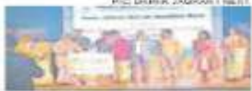
डीएवी बरियातू का मॉडल भी हुआ चयनित

BARANCHI (12 Nov) • पंचसंस्था के तहत गठित समिति ने डीएवी बरियातू के मॉडल को चयनित किया। समिति ने डीएवी बरियातू के मॉडल को चयनित किया।