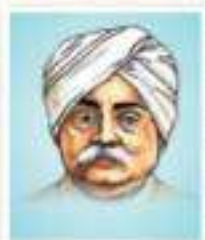
Lala Lajpat Rai